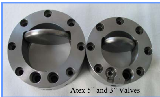
Atex 5" and 3" Valves

The ATEX Explo Guard Dry Chemical HRD is designed to use the minimum of parts for valve opening to achieve the maximum speed of operation. The valve uses natural