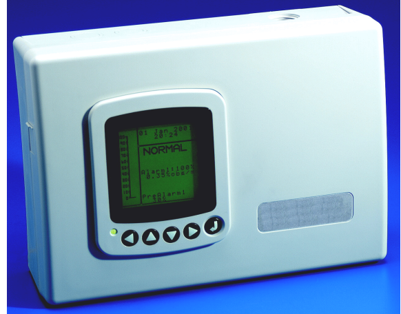
CLASS 2 Detector with optional display module