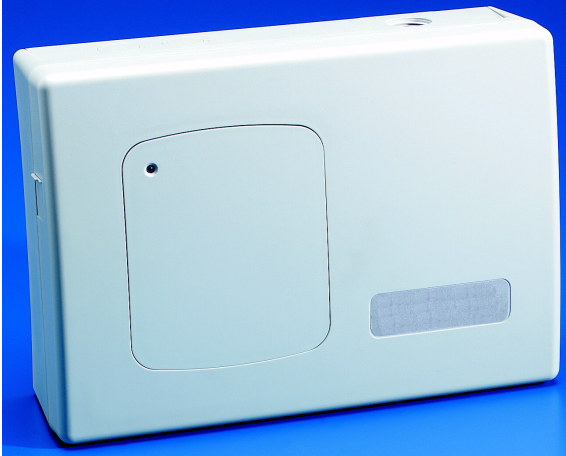
CLASS 2 Detector without optional display module